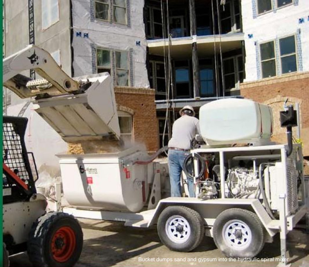
Bucket dumps sand and gypsum into the hydraulic spiral mixer