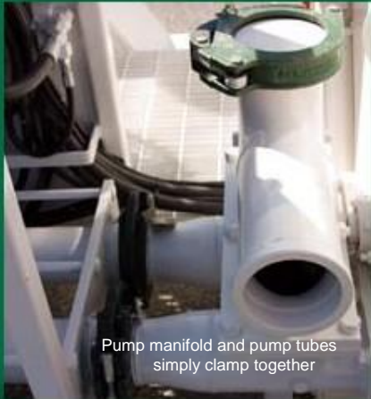
Pump manifold and pump tubes simply clamp together